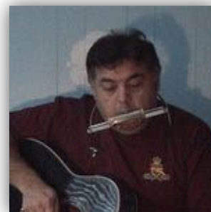
MARIPOSA FOLK FESTIVAL 2006

He is currently the Manager of Springwater Provincial Park.